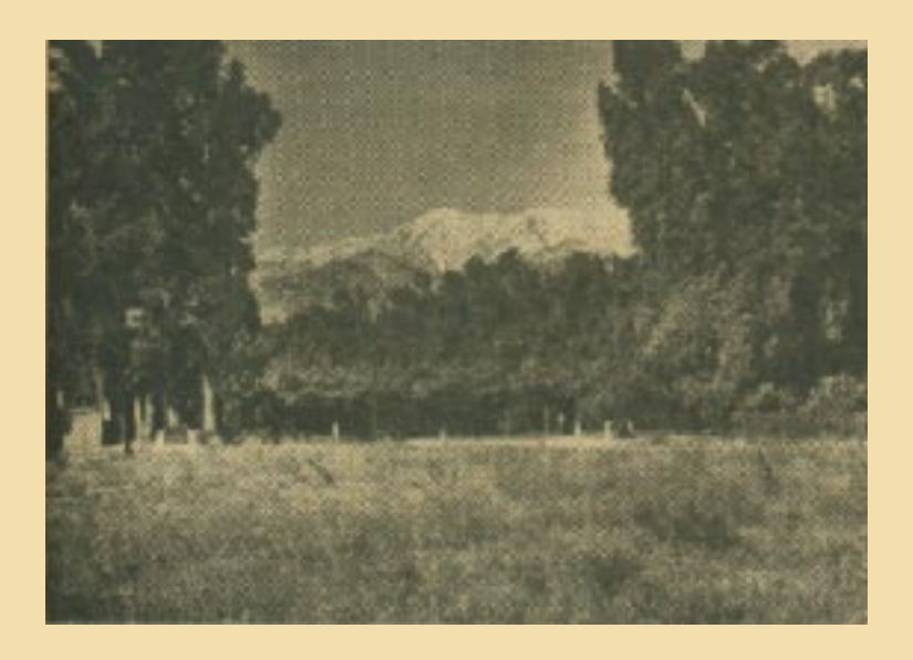
EISENHOWER MANY YEARS AGO This view is where EHS is now located.